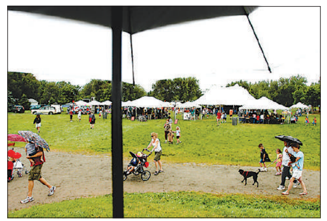
People brave a rain shower to check out booths at Roger's Grove. Left: Rebecca Penrod, 16, and Christian Gonzalez, 15, dance to the sounds of Face, an all-vocal band, at Rhythm on the River.